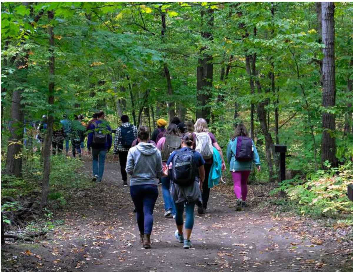
A group of participants walking at the Biennial Breath of Fresh Air Outdoor Play Summit at Wesley Clover Parks in Ottawa, Canada.

OPC held the third biennial Breath of Fresh Air Outdoor Play Summit at Wesley Clover Parks in Ottawa (the first was held in 2019 by the Child Nature Alliance of Canada and the second was held in 2021 by OPC but held entirely online due to the COVID-19 pandemic). The sold-out Summit consisted of three days of talks, workshops, panel discussions, and playful activities all held entirely outdoors. The post-Summit survey we circulated showed that over 80% of participants enjoyed all aspects of the Summit. We received constructive feedback, in particular some guidance on how to ensure that future Summits are inclusive and attentive to the needs of equity-denied groups.